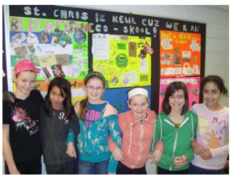
Right: Members of the St. Christopher Rosary Club, who meet each Wednesday at afternoonrecesstopraythe Rosary.